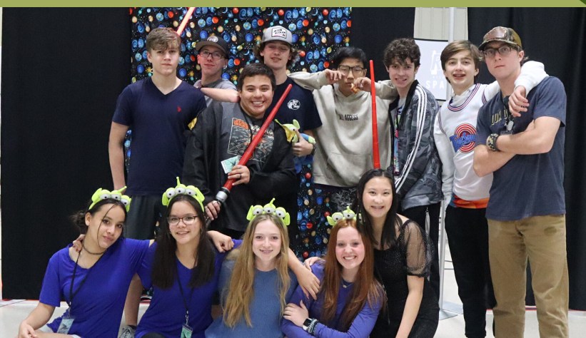
The CB students ministry enjoyed "Space Night" at their Bridge event, January 25th.