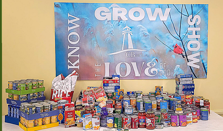
The CB kids ministry had a "food fight" to see what group could collect the most food items for the BOL ministry. Winner: 1st & 2nd grade group.